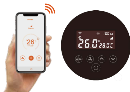
Wi-Fi Built-in Touch Controller